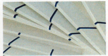
SIMPLE, REPETITIVE ELEMENTS FORM A COMPLEX OVERALL SHAPE.